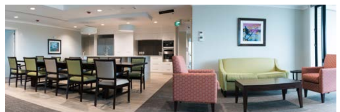
A typical household dining and lounge layout in our new care centres

The 'Oscar' winners are to be announced in Singapore on 16 May 2018, so fingers crossed!