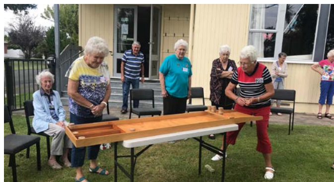
Guests at the Chartwell Selwyn Centre enjoy a full programme of activities

To find a Selwyn Centre near you, visit: www.selwynfoundation.org.nz/community/selwyn-centres/