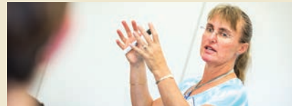
A wide range of learning and teaching resources will be offered by the Selwyn Institute.

Guided by a new Advisory Board established this year, the Selwyn Institute is committed to deepening the understanding of the ageing and spirituality journey, so that the lives and wellbeing of older adults and the aged care population as a whole may be enriched both now and in the years to come.