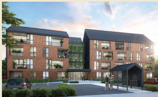
A design concept of what the Henderson Valley Road development may look like.

Application forms for Haumaruru Housing homes are available to download at www.haumaruruhousing.co.nz or by ringing 0800 430 101.