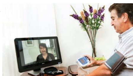
Inviga's health telemonitoring service enables people to receive timely healthcare support and advice in the comfort of their own home.

For further information on Inviga's range of services, call 0800 301 234, www.inviga.co.nz