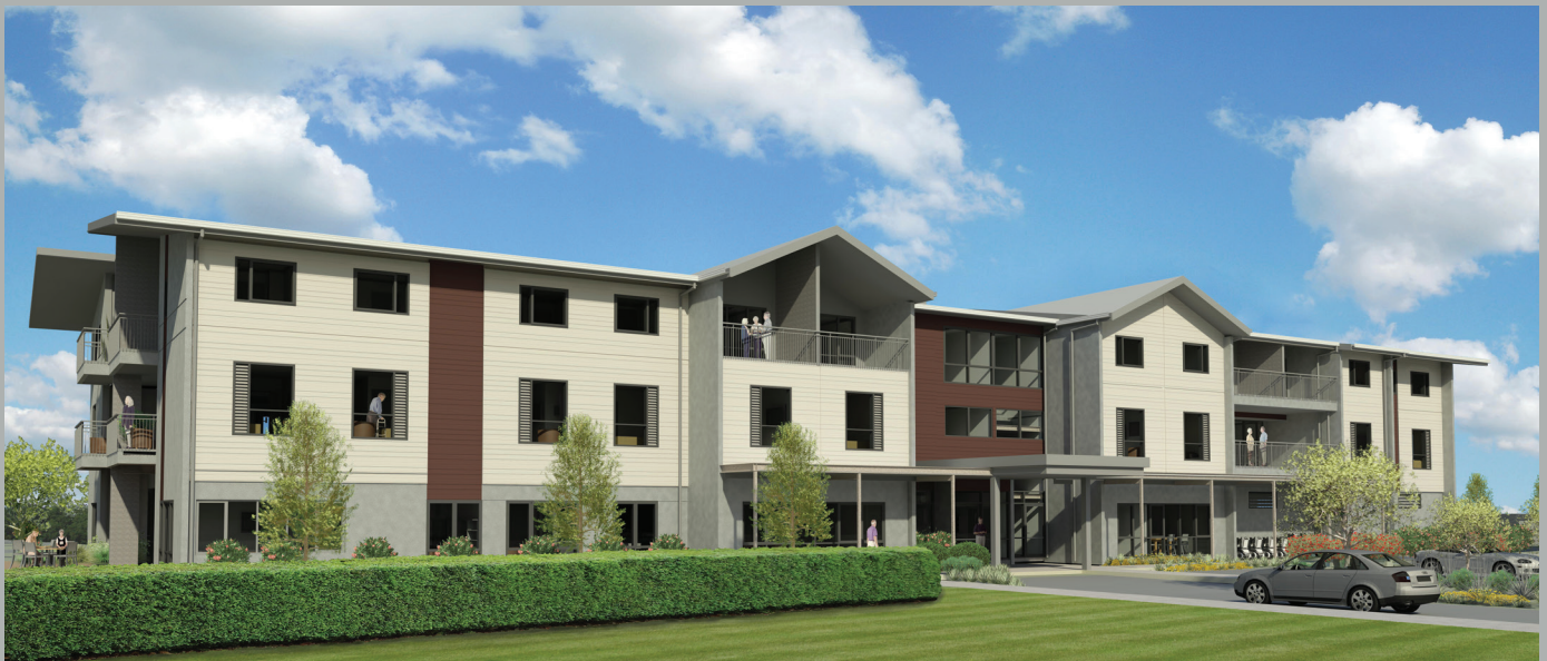
Artist's impression of the new Moxon Centre at Selwyn St Andrew's village in Cambridge

Our new care residences are tremendously exciting for the Foundation and represent a brand new concept in care delivery – called The Selwyn Way – which is unlike any other in New Zealand. Offering an array of innovative design features and an advanced model of care, they'll enable us to provide personalised care and services that enhance older people's wellbeing and will be worthy of our senior citizens for many years to come.