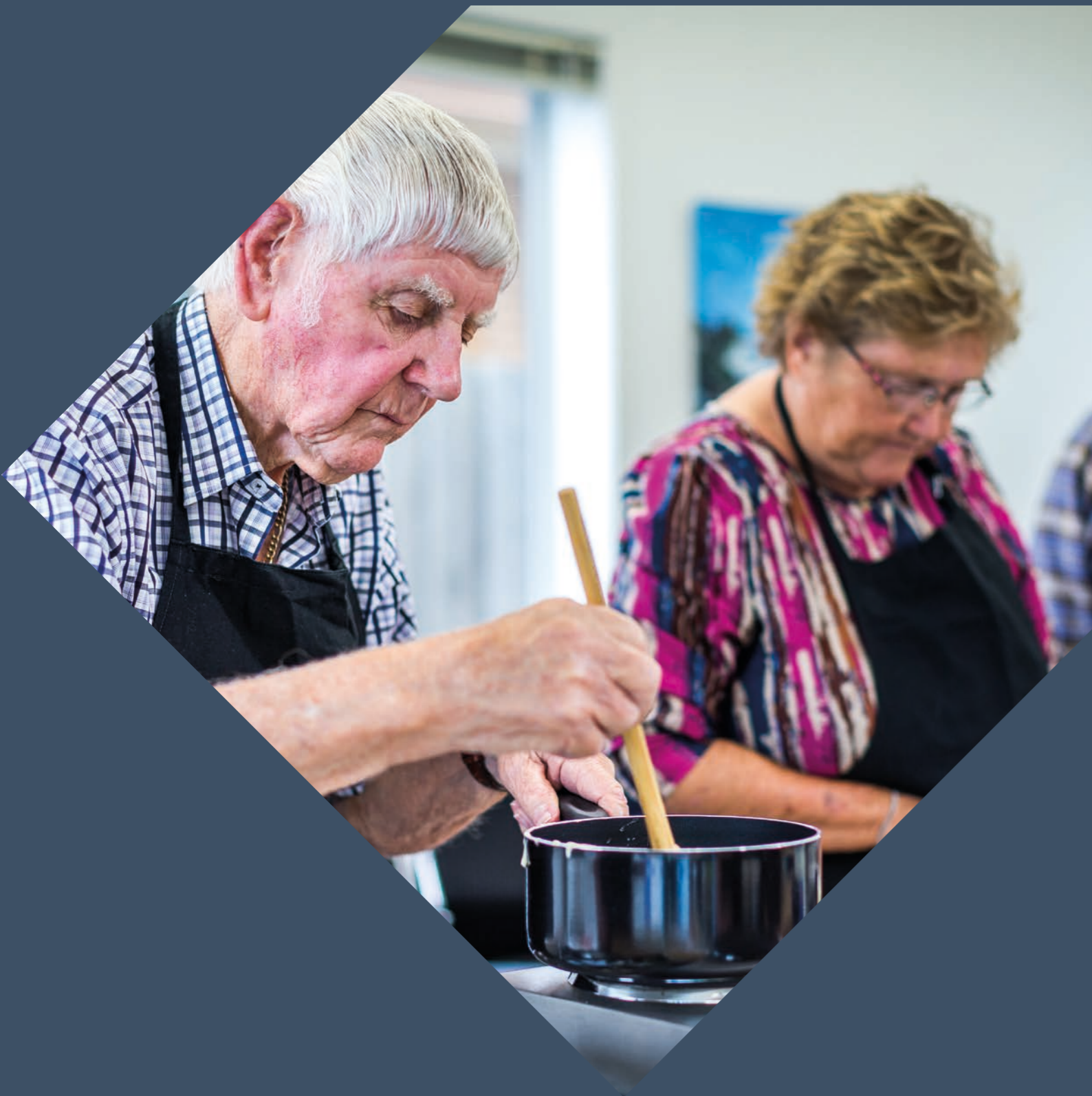
Image: Participants of the Whangarei Anglican Care Trust's inaugural Senior Chef cooking course, funded by the Foundation.

As for the future, we are developing a comprehensive community services model which will promote collaborative and integrated care across the whole continuum of care provision. Innovative technology-based, self-directed 'telehealth' pilots are planned, the outcome of which will allow us to respond to the changing needs of the ageing population and, significantly, enable people to live safely and independently in their homes for longer - the key to enhanced wellbeing for elders and their carers alike.