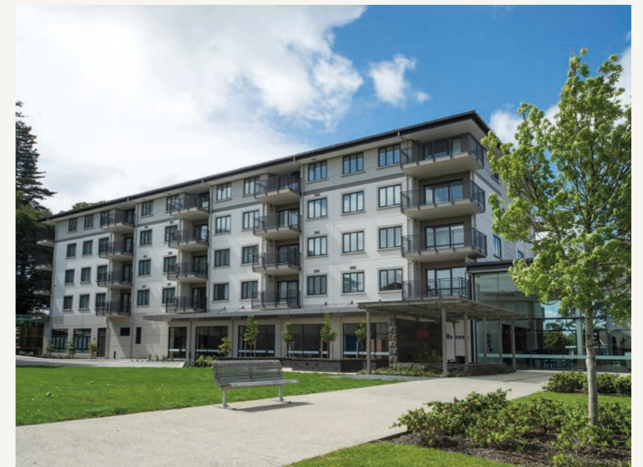
The Reeves Apartments opened in 2014 at Selwyn Heights.

Cash flows from operating activities were down by $23.9m compared with the previous year. Receipts