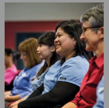
Image: Graduates of the Foundation's pilot Business Communications Skills course for staff.