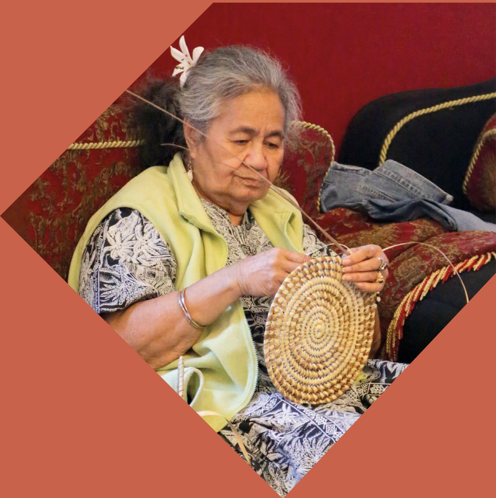
Image: A guest at the Clendon Pacific Island Selwyn Centre taking part in one of the many activities on offer.

Investment in such partner organisations complements our charitable mission, allowing us to extend our outreach within society and, therefore, make a difference to the lives of so many more older people and those in greatest need.