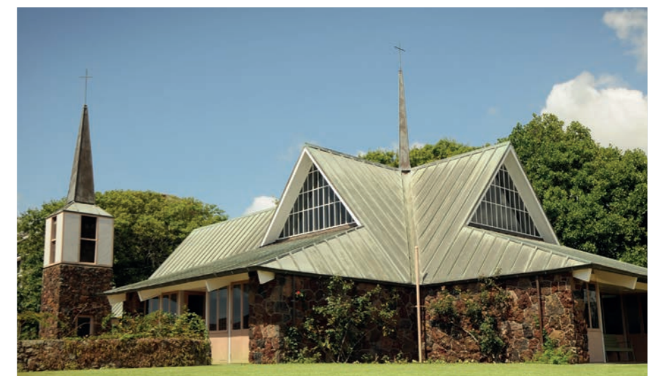
Chapel of Christ the King, Selwyn Village